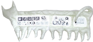
Shashi Arnold innocence 2023 Paper, stuffing, thread 23ft x 1.5ft x 2in