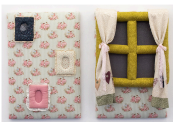
Lucia Gallipoli Sorry, You Look Like Someone I Only See at Night 2024 Cradled wooden panels, polyester quilting batting, cotton fabric, secondhand curtains, vintage picture frames, thread. 48x36x4 in