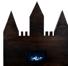
Chloe Abidi Dream Ballet 2025 wood, 7" monitor, video 23.5 x 23.5 x 2 in