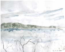
Qingyuan Liang Travels in Switzerland 2023 16x12 in x3 NFS