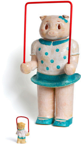
Jumping Rope Piggy Girl , 2024, 14x12x26 in, Stoneware with underglaze and glaze, Cindy Zhaoyue Chen