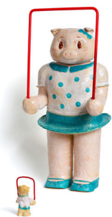
Cindy Zhaoyue Chen Jumping Rope Piggy Girl 2024 Stoneware with underglaze and glaze 14x12x26 in