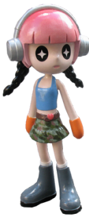
Meiting Song Girls 2024 Pla 3d printed + acrylic 20cm tall $400