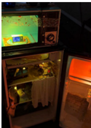
Zhihan Liu A Home Only without Me 2026 Mixed media Approx. 8 x 8 ft