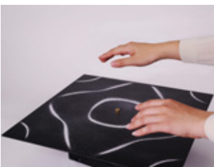
Shiqi Zeng IMPROV 2026 Steel plate, sand, sound, vibration, and projection Dimensions variable