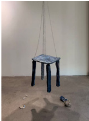
Cai Charlotte Fei Gone 2026 Paper mache, cyanotype chemicals, concrete, stainless steel, and found materials 30 x 35 x 60 in