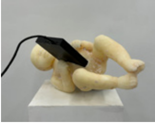
Luyi Wang Forecasting Forecasts 2026 Beeswax, digital display, and custom software Approx. 18 x 7 x 6 in