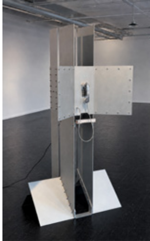
Yichen Ji Synthetic Genesis 2026 Aluminum, titanium, resin, phone directory, and large language model 39.8 x 79.5 x 33.7 in