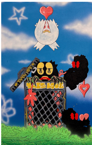
I am trash? 2025 Aerosol, Spray Paint, Oil and Paint Marker on Canvas 26 x 40 in