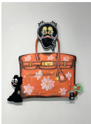
Power 2025 Spray paint and Oil on Wooden panel 27 x 29 in $2,800