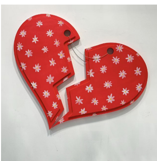
Perfect two 2025 Spray paint and Oil on Wooden panel 15 x 23 in $1,800