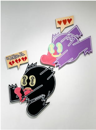
Heart Pang 2025 Spray paint and Oil on Wooden panel 21 x 25 in 24 x 19 in $2,600