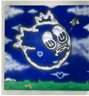
Echo of you 2025 Spray Paint, Paint Marker and Aerosol on Canvas 48 x 48 in $3,200