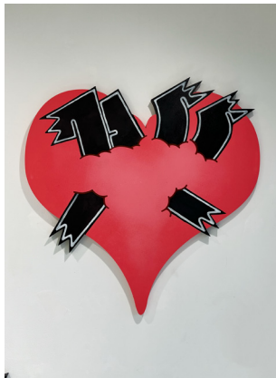
Dive 2025 Spray paint and Oil on Wooden panel 26 x 26 in $2,100