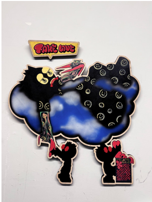
Fake Love 2025 Oil, Spray Paint and Aerosol on Wooden Panel 30 x 29 in