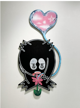
You are flower 2025 Spray paint and Oil on Wooden panel 23 x 45 in $2,600