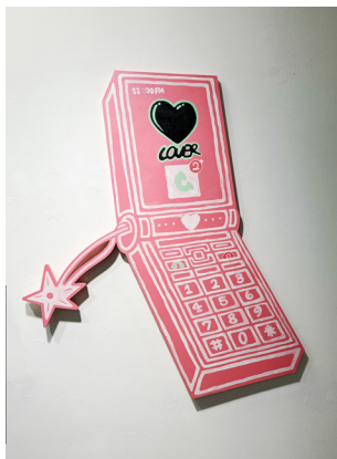
Ring Ring 2025 Spray paint and Oil on Wooden panel 28 x 30 in