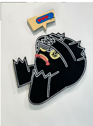
Delivery attempt: xx/ xx /2025 2025 Spray paint and Oil on Wooden panel 24 x 25 in $2,200