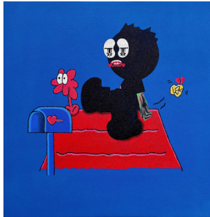
Scam 2025 Spray Paint and Oil on Canvas 22 x 22 in