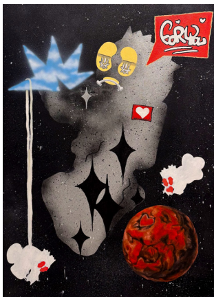
Star 2025 Oil Paint, Spray Paint and Aerosol on Canvas 30 x 40 in