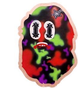
$185 2025 Oil and Aerosol on Wooden Panel 19 x 27 in