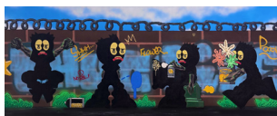
Thug life 2025 Aerosol, Spray Paint, Paint Marker and Oil on Canvas 24 x 60 in $3,400